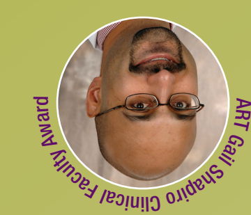
University of Michigan H9M OM, tsitqs8 9 nslA $50,000 (2nd payment of award) $150,000 over 3 years